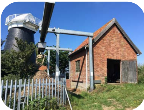
Norton Pumping Station