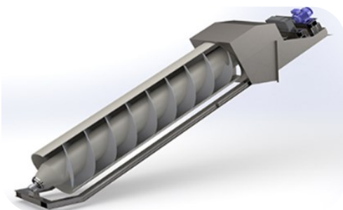
An Archimedes screw pump

This type of pump provides passage for fish and eels and has the advantage of operating over a broad range of flow rates, helping to maintain stable water levels within the catchment.