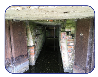
Short Dam Pumping Station Inlet