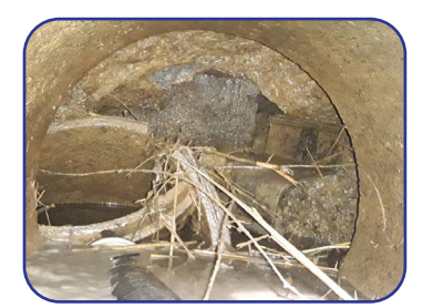
Culvert beneath Barsham Brook

The project is funded by the government. The main source of funding for the construction phase is Environmental Statutory Allowance (ESA) funding. The ESA funding was introduced as part of the current £5.2billion 6-year FCERM capital programme (2021-26). To date we have secured funding, which includes a share from ESA, for Norton and Raveningham Pumping Station Replacement and Upper Thurne Integrated Drainage Improvement project (delivered by Broads IDB).